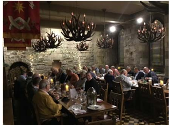
very successful year.

With the backdrop of a medieval dining room, everyone took their places at the tables and with drinks flowing and fantastic company we started the evening. With the meal in full flow and drinks being enjoyed, the night went well. It was an evening to be proud of and to celebrate what was a